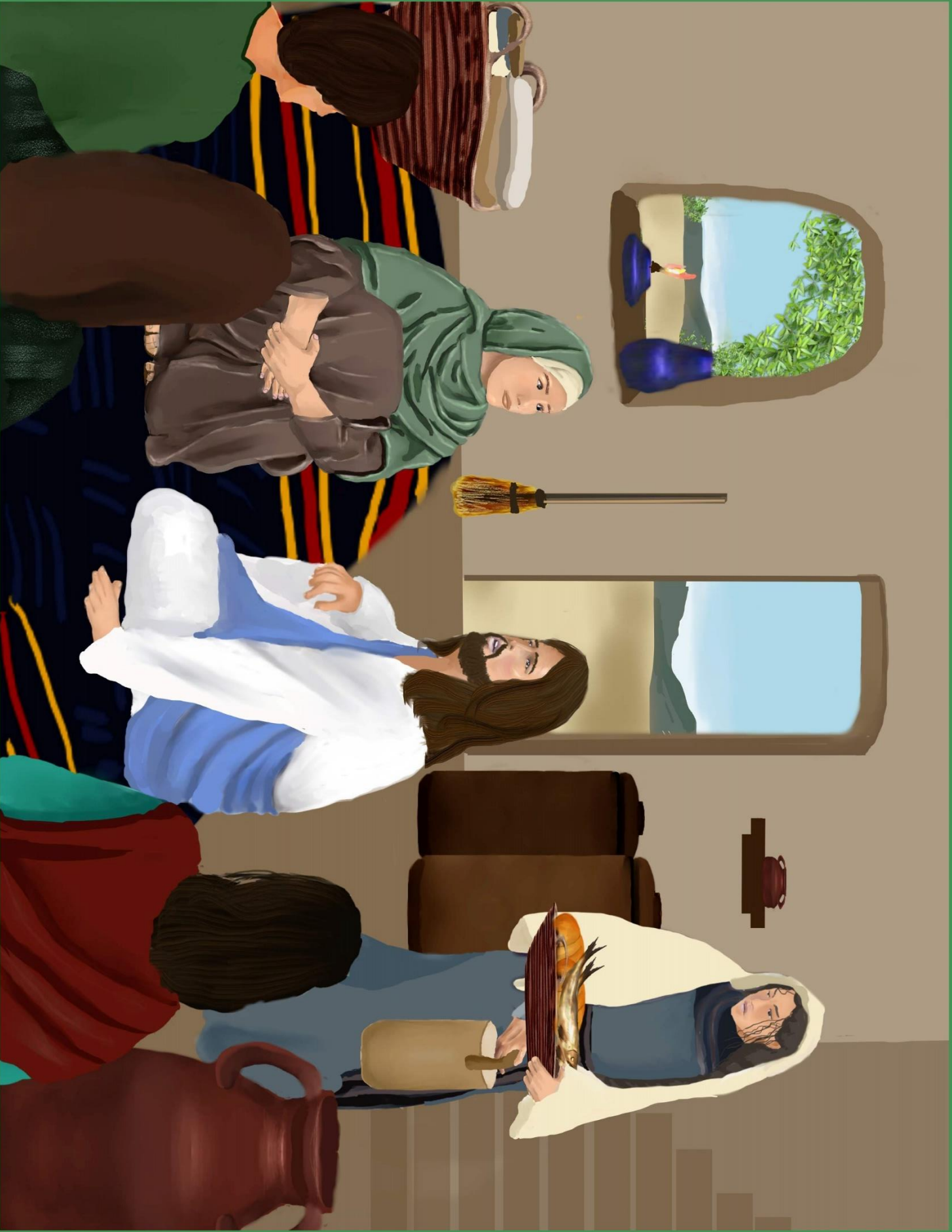
TALKING WITH GOD