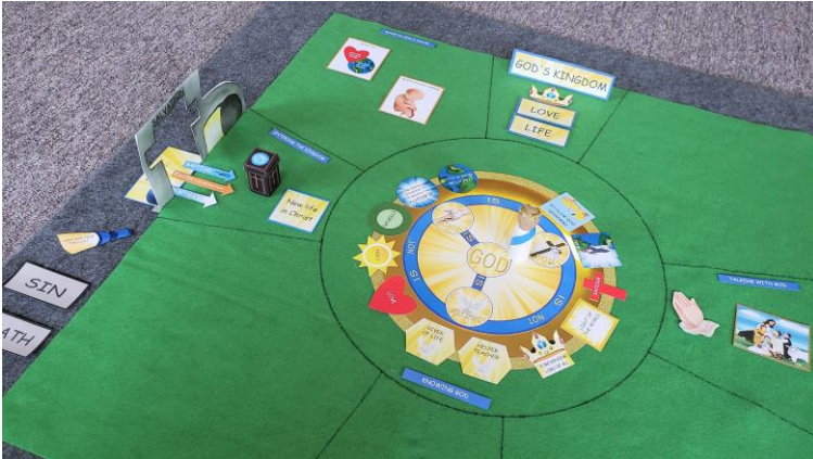
This is how the storyboard should look at the start of the lesson.