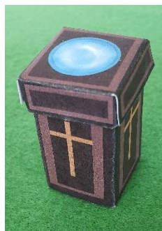
The finished font should look like this

Cut along solid white lines Fold flaps along stippled white lines Fold all four sides down and glue onto flaps to form a square lid that fits over the cuboid pillar.