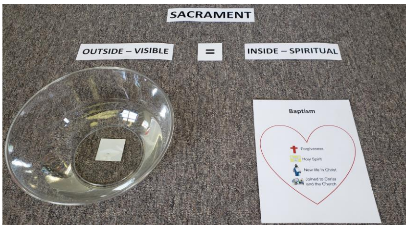
This is how the sacrament teaching should look.