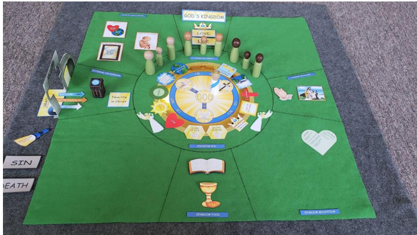
This is how the storyboard should look at the start of the lesson