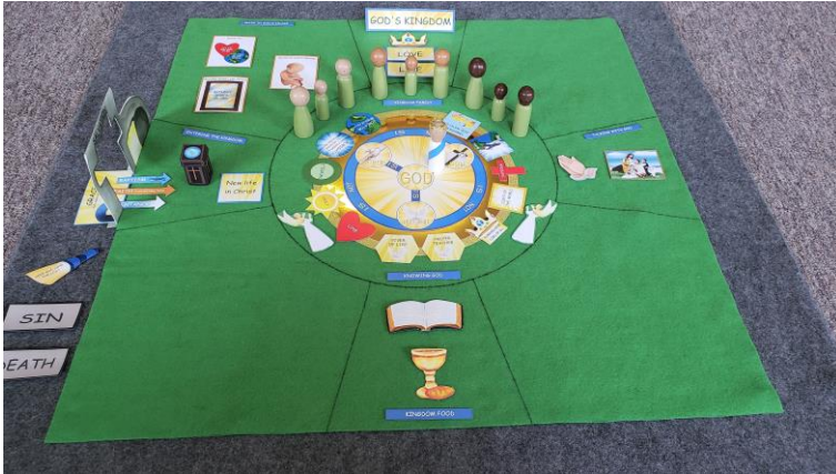
This is how the storyboard should look at the start of the lesson