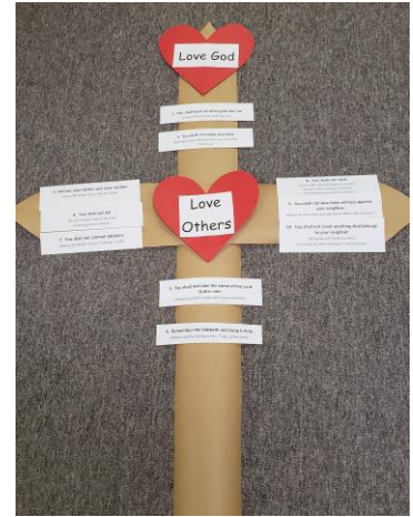
Ten Commandments cross