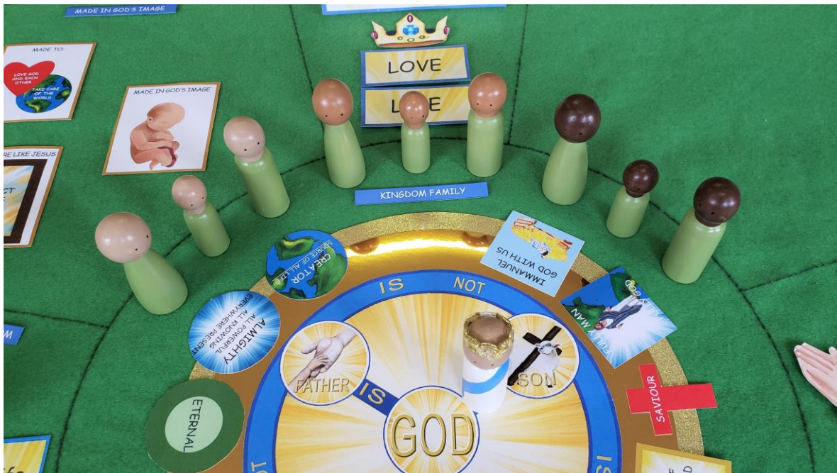
This is how the Kingdom Family section should look at the end of the lesson. After the lesson, leave all the peg dolls and symbols on the storyboard for next week.