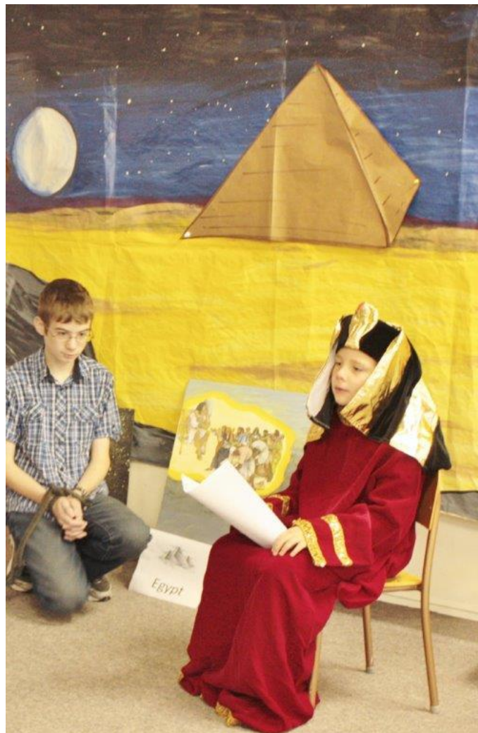
Joseph before Pharaoh