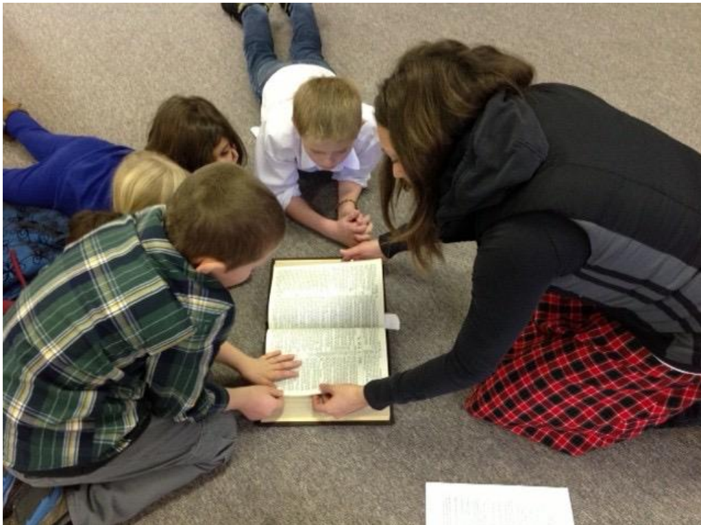
Looking at the books of the New Testament together

Memory Verse: (Found on the last page of this lesson plan.) Printed out and placed inside the large Bible.